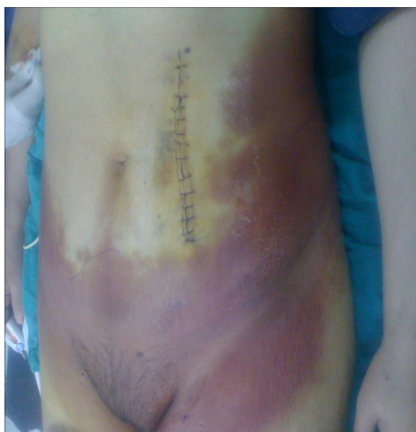
Figure 1. Large erythematous skin rash.

Postoperative recovery was uneventful as far as the abdominal wall was concerned and patient continued subsequent neurosurgical management.