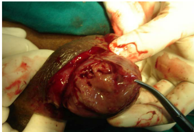
Figure 1. Necrotic material with yellow plaques in testicle.