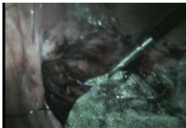
Figure 2. Medial thread.