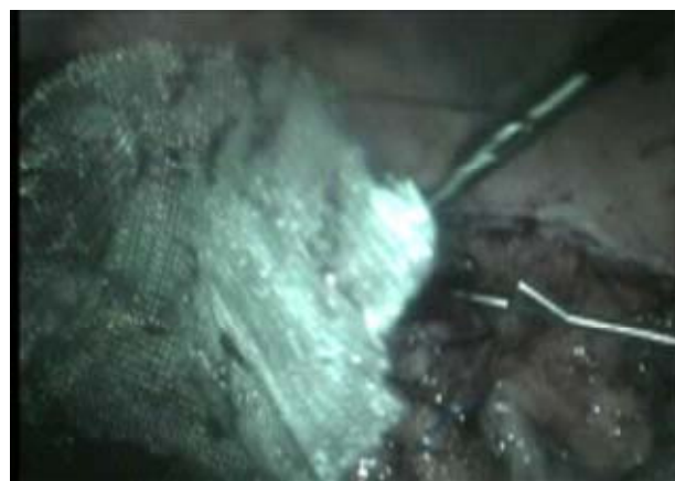
Figure 3. Port closure device opened.