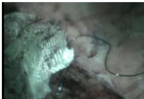
Figure 1. Lateral thread.

threads that are tied with the knots towards the back ( Figures 1 and 2 ), to be facing the abdominal wall when it is pulled using the port closure device, which is introduced obliquely twice, first just medial to the anterior iliac spine, second lateral to midline ( Figure 3 ), pulled ( Figure 4 ) then tied in place. We used 8 × 12 cm mesh to cover the myopectineal orifice applied onlay on cord structures.