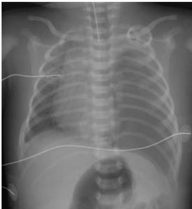
Figure 1. Chest X-ray on postoperative day 7 shows a moderate left-sided pleural effusion (white arrow).

The diagnosis of chylothorax is made for an unfed infant if more than 90% of the leucocytes in the fluid are lymphocytes [9]. If the infant had been fed, the diagnosis is confirmed if the fluid appears chylous, and if the triglyceride level is higher and the cholesterol level lower than that of plasma [3,10]. We diagnosed the present case as chylothorax based on the findings that the triglyceride level was higher than the normal range and the cholesterol level was lower than that of plasma.