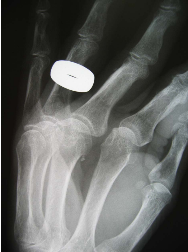
Figure 2. Pre-operative radiograph showing a small abnormality on the volar aspect of the joint but nothing seen dorsally.

carpal head was a small osteochondral fragment, which was impinging at the point of articulation with the base of the proximal phalanx and preventing extension of the joint. This fragment had fractured from the ulnar aspect of the head of the metacarpal on the palmar side and migrated within the joint capsule ( Figures 3 and 4 ). This was removed and the joint irrigated ( Figure 5 ). The passive range of movement of the joint returned to normal. The wound was closed and the hand placed in a resting splint.