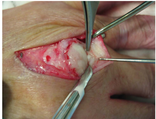
Figure 4. Small osteochondral fragment found lying within the joint on the dorsal aspect of the metacarpal head.