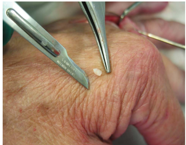
Figure 5. Osteochondral fragment after removal.