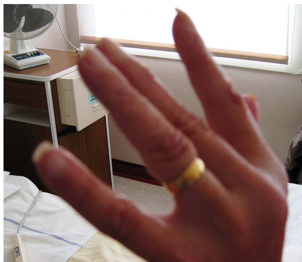
Figure 1. Left middle finger held in 30 degrees of flexion and significantly deviated to the ulnar side.

The MCP joint capsule was then opened and explored. Lying within the joint on the dorsal aspect of the meta-