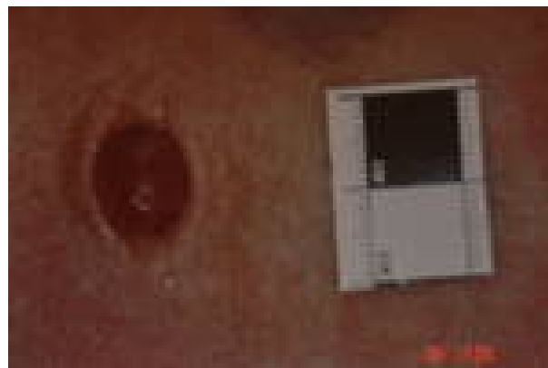
Figure 1. Clinical photograph showing patent vitellointestinal duct presenting as umbilical granuloma.

On examination the infant was well grown, comfortable and had no abdominal distension. Pink-red, fleshy tissue, about 1 cm in diameter, protruded from the umbilicus. There was no discharge from the umbilicus ei-