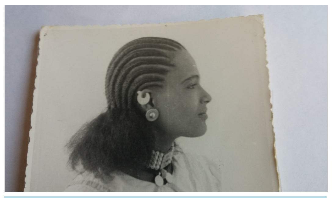
Figure 1. A Madama from Eritrea. Madamism was a formal cohabitation between an Italian man and an Ethiopian woman.

When we were in Ethiopia to accomplish a Ph.D. research we concluded (maybe too rapidly) that only men could meet the process of progressive insabbiamento . The reality might be more pragmatic. If Italian men stayed in Ethiopia more importantly than the Italian women it is less related to gender roles but more probably a consequence of population density and balance. The young colons came as singles and found local partners because it was due to the demographic context. Amedeo Venditti expresses it lucidly when he says: that he was with an Ethiopian lady because it was the only opportunity he had to share a life with a woman. He summarizes the high number of mixed couples by a narrow " market of marital opportunities ":