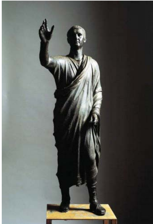
Figure 2. “Lost wax” bronze statue of the artist (Arringatore), Pila (Perugia, Italy), 1 st century BC (Photo by DEA/G.Nimatallah/De Agostini/Getty Images).