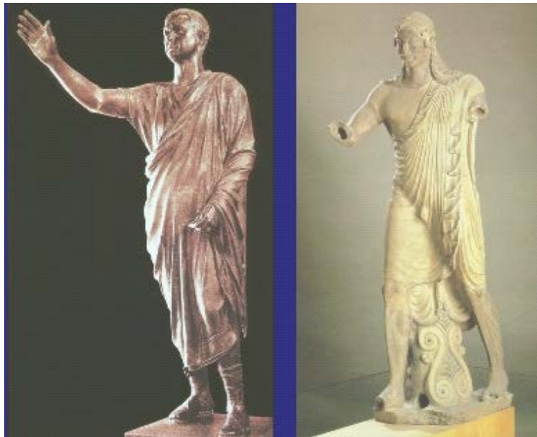
Figure 3. Comparison of the speaker and Apulu (Apollo of Veii), 510-500 BCE. Painted Etruscan terracotta. National Museum of Villa Giulia, Rome.

the wheel turns, it is essentially and always a question of time. But when we say this, when we become matrix and have children or create an association of people to share our ideas, or in some other way “leave our mark” in the social or