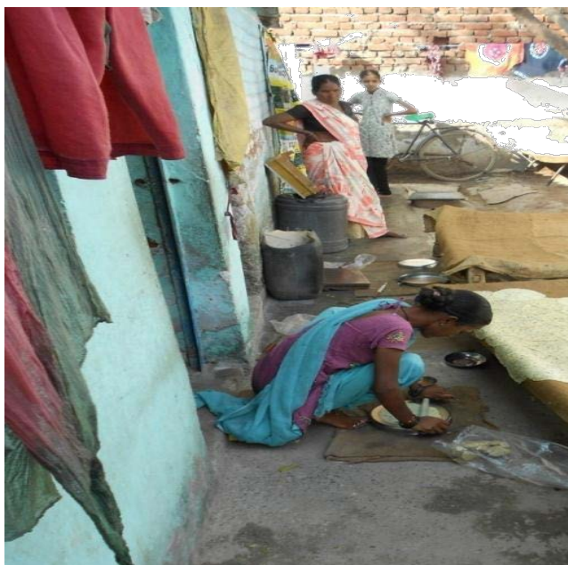
Figure A1. Before modification rolling Papad style adopted by woman.