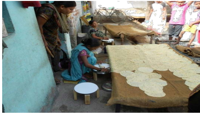
Figure A2. After modification rolling Papad style adopted by woman.