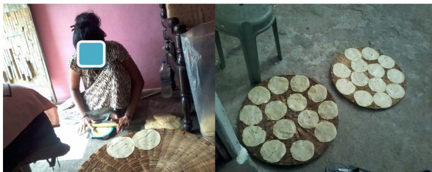
Figure 1. Women rolling Papad at home, sitting on the floor with forward bending shoulder protracted, wrist flexed with faulty lower limb posturing (original image).

The informal sector and small-scale industries in particular, are subjected to numerous workplace hazards [7] [13] and health hazards. These women require attention and modification in their traditional way of the method of preparation, as this ignorance can cause many musculoskeletal problems and pain. This ultimately results in deterioration in health and working capacities [12] [13]. In order to identify the occupational health hazards in the population of “Papad” Making women, this study was carried out. In this study, an attempt has been made to find out the musculoskeletal problem of the women engaged in “Papad Making” industry.