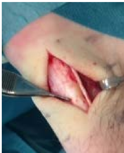
Figure 4. Plantaris tendon found in close relation to the medial side of the thickened Achilles tendon in a patient operated with a scraping procedure for midportion Achilles tendinosis.