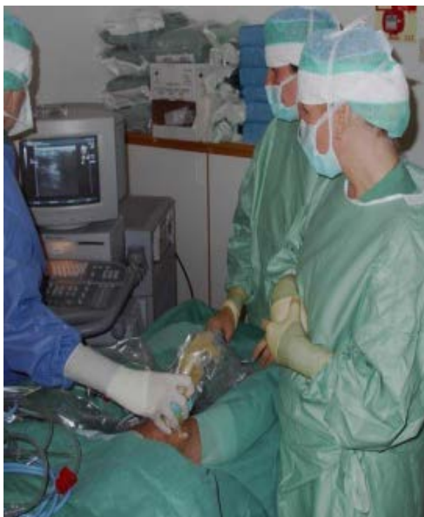
Figure 5. Ultrasound and Doppler-guided arthroscopic shaving in a patient with proximal patellar tendinopathy (Jumper's knee). The ultrasound picture (see monitor) is guiding the arthroscopic shaving procedure.

For the proximal patellar tendon (Jumper's knee), an ultrasound + Doppler-guided arthroscopic shaving procedure was invented (Figure 5), and the clinical results are similarly good as for the Achilles midportion [18] [19]. Ultrasound + Doppler follow-ups show decreased tendon thickness and a more normal structure over time (submitted).