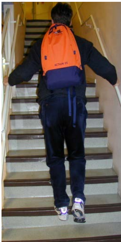
Figure 1. Eccentric calf muscle training.

Furthermore, ultrasound follow-ups showed improved and more normal tendon thickness and structure [4]. The findings were unexpected, and more or less against previous thinking on treatment of chronic painful tendons.