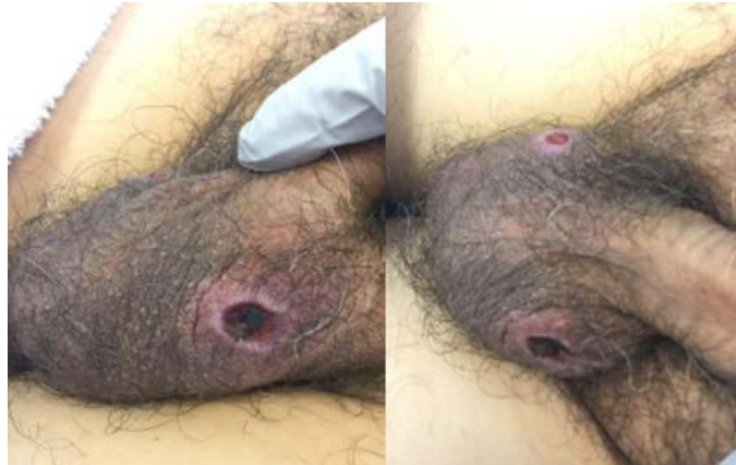
Figure 4. Follow up images with healing bilateral scrotal tissue.