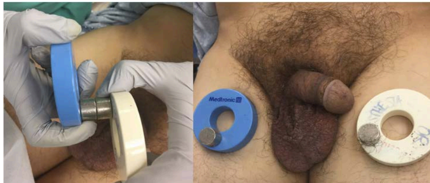
Figure 2. Magnet complex with cardiac magnets after removal.

Patient returned 2 weeks later, had no new complaints and no pain or swelling of the scrotum. Scrotum had small dime-sized circular inflamed scar with darkened crust in middle with pale pink raised border and with no surrounding edema or erythema ( Figure 4 ).