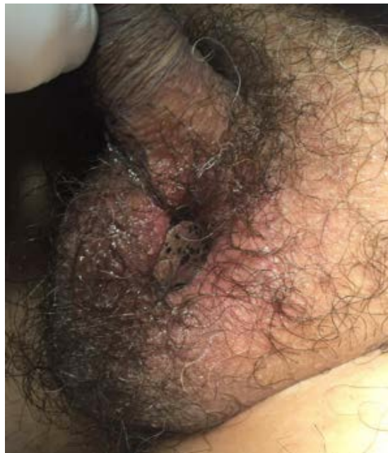
Figure 3. Partial thickness pressure necrosis after removal of magnetic foreign body.