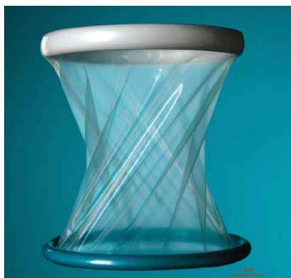
Figure 2. Alexis® autostatic wound retractor (XS size).