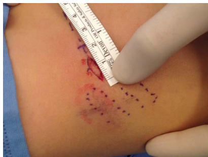
Figure 1. A minimal surgical incision (in this case about 14 mm) on the prolongation of the 11 th /12 ve rib.

It consists of a round wound retractor, originally designed for abdominal surgery, made of a cylindrical membrane sheath that has two rings (upper and lower) attached to each open end ( Figure 2 ).