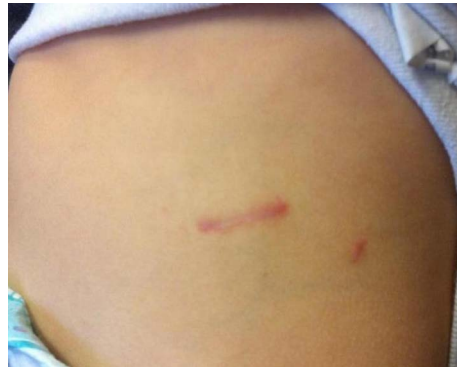
Figure 7. Follow-up at 1 month.