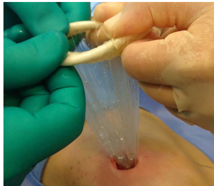
Figure 3. The autostatic retractor in place, being rolled up.

Traditional Anderson-Hynes dismembered ureteropyeloplasty is then performed using 6/0 vicryl interrupted suture under 2.5 extended field magnification and an Urosoft ® stent or a double J stent is positioned inside the pelvis and the ureter through the sutured anastomosis. In the first 27 cases we also used a Penrose drain that was not positioned in the following ones.