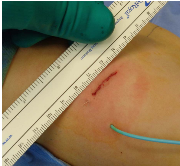
Figure 6. Surgical incision with the blu-stent in place.

The stent (“blue stent” Angiomed Urosoft ® , Bard, UK) [6] is positioned transanastomotically with the straight limb brought through a lower calix of the kidney and then outside throughout the skin, away from the wound ( Figure 6 ), while the other limb is placed directly into the bladder or, in some cases, the pig-tail is cut and positioned in the ureter. The intermediate pig-tail is kept into the renal pelvis.