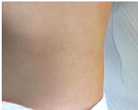
Figure 8. Surgical incision after 1 year.