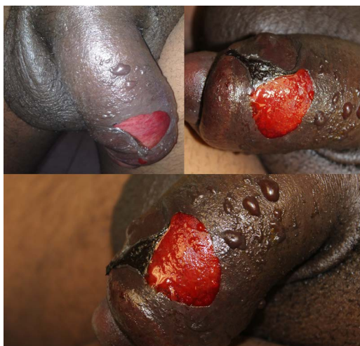
Figure 1. Diffuse penile swelling.