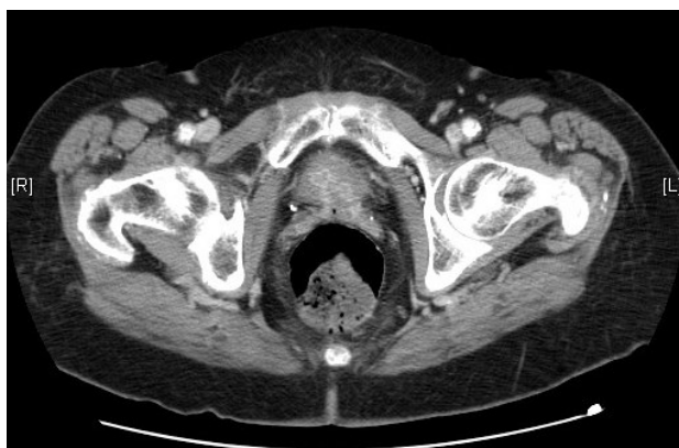
Figure 1. Contrast CT of the pelvis demonstrates a discernable mass in the area of the bladder trigone extending into the anterior vaginal wall.