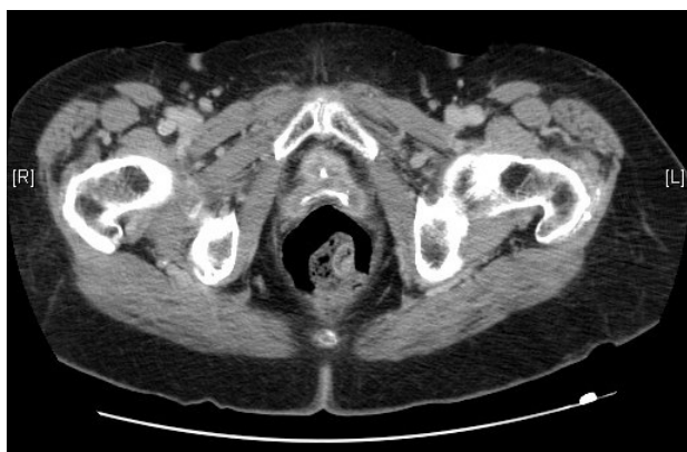
Figure 2. Delayed phase contrast CT of the pelvis demonstrates vesicovaginal fistula with presence of contrast within the vaginal vault.

bladder neck lesion. Vaginoscopy was also performed with biopsies of the anterior vaginal wall and fistulous tract also obtained. Histologic analysis revealed numerous foamy histiocytes. Immunohistochemical staining demonstrated positive staining for CD68 ( Figure 3 ) a known marker for macrophages.