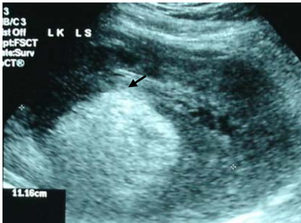
Figure 1. Ultrasound showed echogenic lesion with hyperechoic component suggestive of angiomyolipoma.