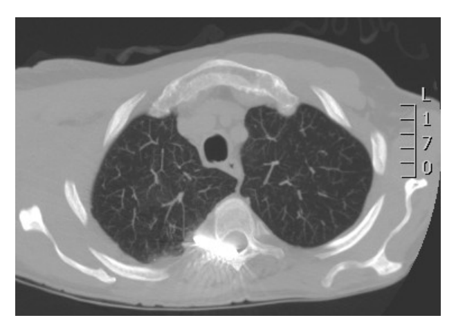
Figure 3. CT-imaging: migration of the pin through the apex of the right lung, towards the spinal canal Th3/Th4.

The pin was removed by pushing it firmly back towards the shoulder and then taking it out, using a heavy needle-holder. The patient was extubated in the operating room; she showed no signs of neurological deficit. The