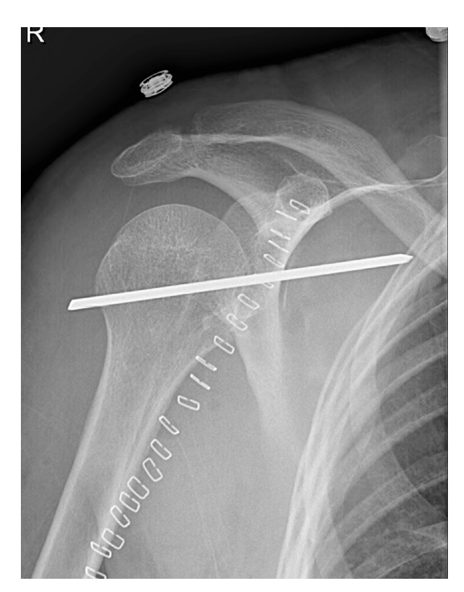
Figure 1. Anteroposterior X-Ray showing correct positioning of the glenohumeral pinning.