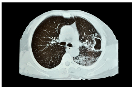
Figure 1. CT chest show cavitory lesion treated by intercostal muscle flap.

scopy was performed for some cases as preoperative assessments. Patients with high risk of lung resection, suspicion of dense adhesion, symptomatic lung abscess not responding to medical treatment, bilateral lung cavity and patients with bad pulmonary function tests were included in group (A), while patients with malignant cavities were excluded from this group.