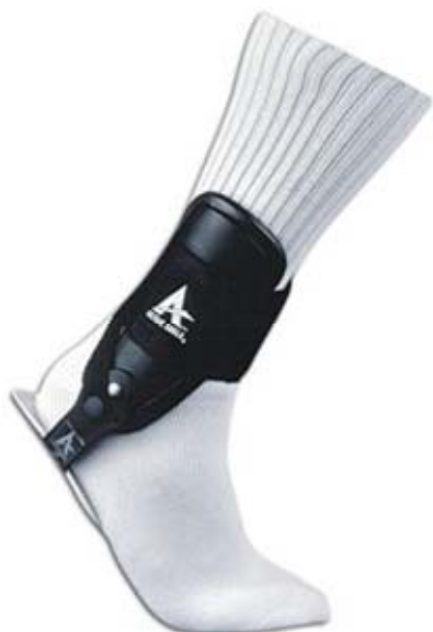
Figure 1. Active Ankle® T-2 brace.

sion. Measurement protocol followed the guidelines from Norkin and White [15]. The same researcher applied the brace and assessed ROM with the same 6-inch goniometer for each subject. The brace was reapplied if it did not produce appropriate restrictions. Once the brace was applied correctly, it was not adjusted during testing.