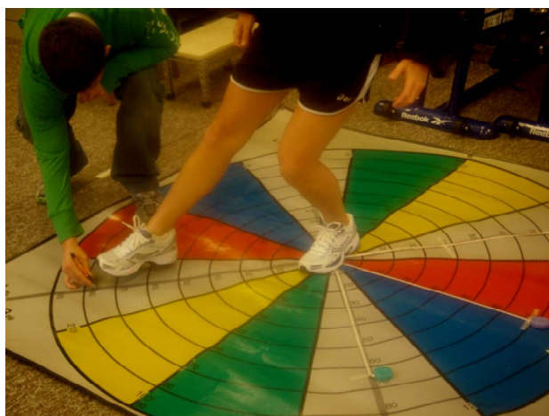
Figure 3. Performance of the SEBT.

Countermovement Jump Height (CMJH). Mean CMJH ( \pm S.D.) are reported in Table 1 . On average, the height of the jump trials after fatigue were less than that of the non-fatigued trials, yet the values were not significantly different ( p = 0.269 ; power = 0.91). Bracing the ankle did not have a significant effect in either condition ( p = 0.329 and p = 0.127 for FB and FUB, respectively). Although, the mean jump height ( 47.59 \pm 15.6 cm) for FB was higher than that of the FUB trials ( 45.61 \pm 14.2 cm) these numbers were not statistically signifi-