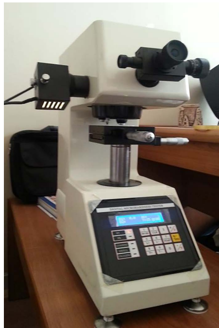
Figure 2. The Vickers Hardness test machine.