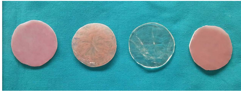
Figure 1. Denture base materials.