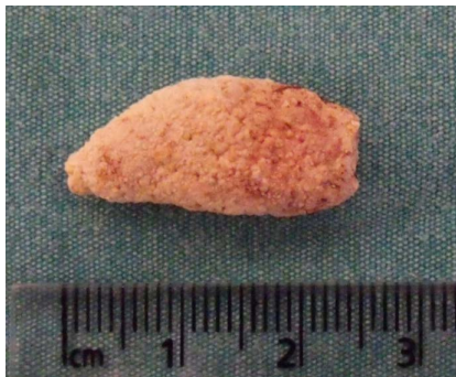
Figure 5. Giant sialolith removed from the Wharton Duct.