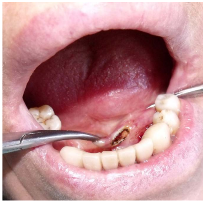
Figure 4. Diode laser was used to incise the mucosa over the sialolith.