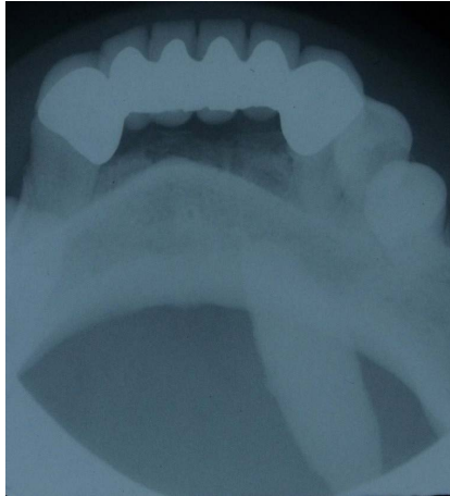
Figure 3. Lower occlusal radiograph showing the sialolith.