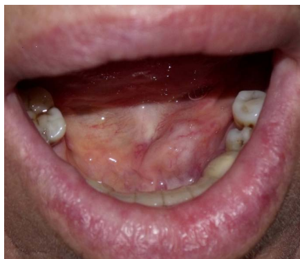
Figure 1. A sialolith which was localized on the left side of the floor of the mouth.

Sialolithiasis accounts for the majority of the salivary gland dysfunction and is the most common factor of