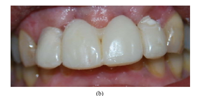
Figure 4. The provisional denture is in place. This view was obtained after 1 week of implant placement.