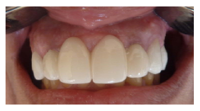
Figure 7. Definitive crowns in place.

In the present case, soft tissue loss around the crowns (Figure 1) and decreased bone heights around the roots belonging to the maxillary incisors (Figure 2) can be seen. Extracting the incisors and waiting for the healing period before implant placement would cause an increase in bone and soft tissue resorption. This will affect the implant and crown lengths. As mentioned before, short-implant and long-crown combinations will result in mechanical risks and an unaesthetic view. It was reported that implants placed in extraction sockets have similar outcomes as placement in healed sites [5]. For healing site implant placement, 4 - 6 months are needed for osseointegration after the healing of extraction sockets [8]. Alternative provisional dentures for the anterior regions at the time of osseointegration were described earlier, such as removable partial dentures and resin-bonded fixed partial dentures [7,14]. But a removable partial denture is not usually a tenderness choice for patients and resin-bonded fixed partial denture is not convenient for the loss of four teeth in the anterior maxilla; therefore, immediate loading is beneficial to patient satisfaction. However, provisional crowns can create soft tissue con-