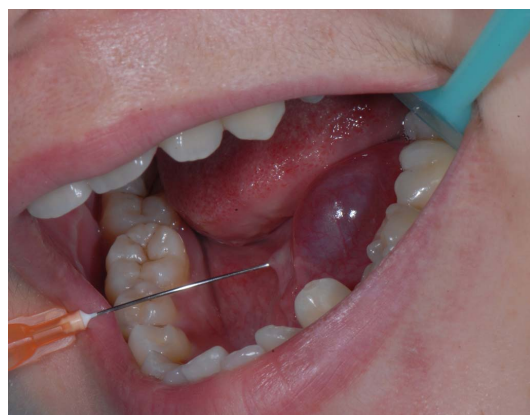
Figure 2. After the point of the needle found intralesionally, Partial cyst fluid was drawn out before sclerosing agent had been injected.