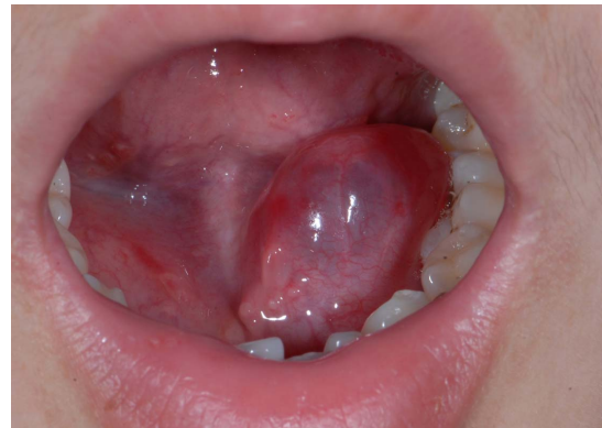
Figure 6. Patients have been observed during the procedure and been for at least 4 hours after the procedure for detection of early complications. Local swelling and pain in the floor of mouth were light. Others complications, such as acute oral inflammation, hemorrhage, and symptomatic embolism of sclerosing agent into submaxillary gland duct were not observed.

Local swelling and pain in the floor of mouth disappeared after the administration of anti-inflammatory agents and oral care. Others complications, such as acute oral inflammation, infection, hemorrhage, mucous necrosis, oral scar, symptomatic embolism of sclerosing agent into submaxillary gland duct, blood routine, hepatic and renal