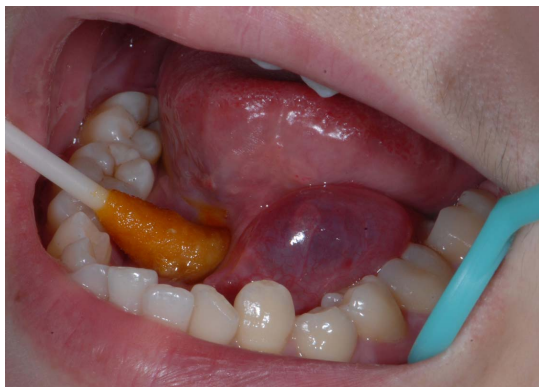
Figure 5. To prevent the cyst liquid mixed residual Pingyangmycin outflow from ruptured cyst, puncture local was pressured for 10 minutes after Pingyangmycin injection

impregnated in the lesions ( Figures 4 and 5 ). Outflow of cyst liquid with residual PYM from ruptured cyst was spitted out. The patient expressed some clinical symptoms such as: local light swelling within 1 week after the procedure, light pain after the cyst rupturing and pain disappearance within 4 - 8 days (mean, 5.3 days). At the same time, the articulation and swallowing function indisposed because of the swelling cyst displaced and interfered the tongue. The procedure was beneficial for the patient with diffuse lesions ( Figure 7 ). The results were reported in the Table 1 .