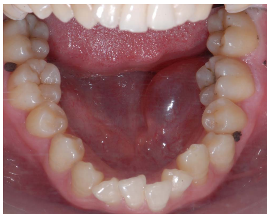
Figure 1. The patient had suffered from a ranula for 35 months, and taken no correlative treatment before accepting treatment.