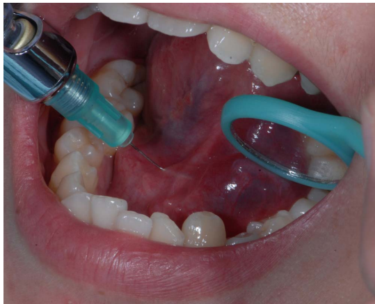
Figure 4. Pingyangmycin was well impregnated in the lesions, The volume of PYM injected was 3.0 ml (total dose of PYM 6.0 mg)