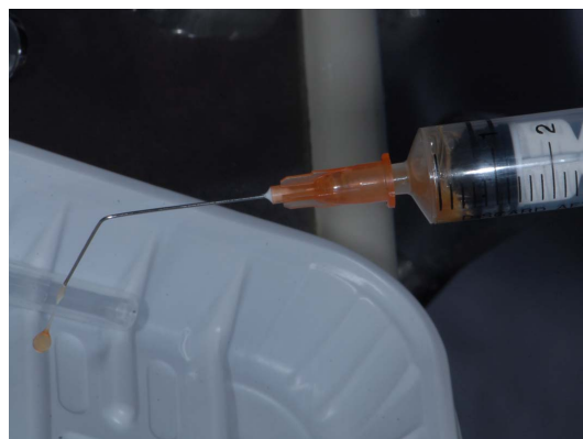
Figure 3. The cyst fluid drawn out show saffron yellow, glutinous liquid after 4 years.

After the point of the needle found intralesionally, Partial cyst fluid was drawn out before sclerosing agent had been injected ( Figure 2, 3 ). The liquid volume aspirated was about half of the cyst. Otherwise, it is difficulty to puncture again. The sclerosing agent was injected slowly to ensure that PYM was confined solely to the lesions. Finally the injection was stopped when the lesion was filled sufficiently ( Figure 4, 5 ). The volume of sclerosing agent injected was estimated by the initial volume of cyst fluid drew out. Care was taken not to go too far medially and to avoid puncturing out of the cystic wall. The puncture site was gently compressed for 5 - 10 minutes with a bandage. Patients were observed during the procedure the time lasted least 4 hours for the detection