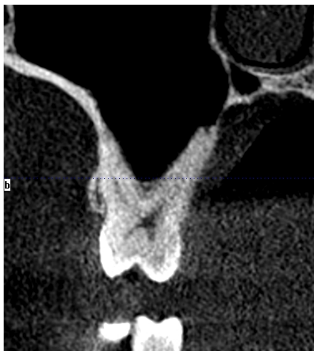
Figure 1. Class 0 relationship between the palatal root and the sinus floor.

Data distributions were expressed as means, standard