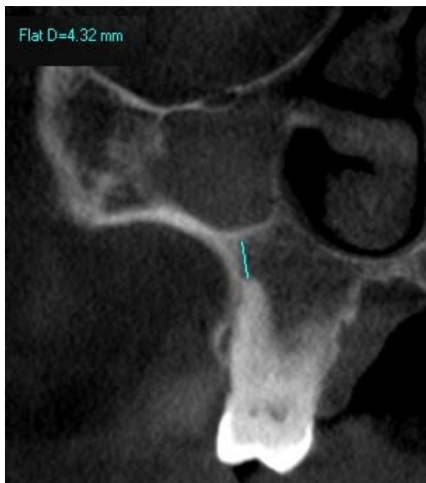
Figure 4. Class 3 relationship between the mesio-buccal root and the sinus floor (4.32 mm).

The Student t -test was used to compare the differences between the mean distances in males versus females. One-way ANOVA (Bonferroni correction) was used to