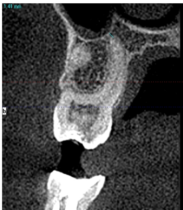
Figure 2. Class 1 relationship between the palatal root and the sinus floor (1.41 mm distance).

deviations (SD), ranges, and percentages, as appropriate.