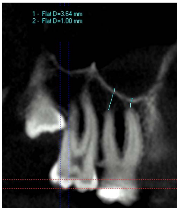
Figure 3. Class 1 relationship between the mesio-buccal root and the sinus floor (1.00 mm). Class 2 relationship between the disto-buccal root and the palatal floor (3.64 mm).