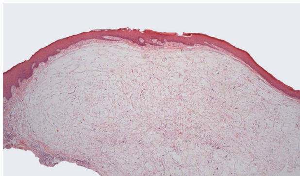
Figure 2. Photomicrograph showing oral epithelium and a well-demarcated but not encapsulated area of myxoid tissue (Hematoxylin and eosin—25×).