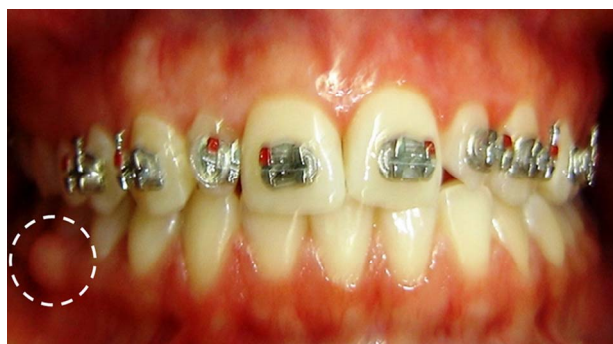
Figure 1. Front view of the orthodontic patient with a well-demarcated, sessile gingival nodule adjacent to the right mandibular first molar (circle).

Gross examination revealed a soft tissue mass measuring 0.9 × 0.5 × 0.5 cm. The histopathological analysis revealed a well-demarcated but not encapsulated area of myxoid tissue with elongated or stellate fibroblasts and small blood vessels ( Figure 2 ). The overlying mucosa composed by stratified squamous epithelium was unremarkable. The lesion was positive for Alcian Blue, pH 2.5 ( Figure 3 ). Based on microscopic findings the final diagnosis was oral focal mucinosis. After 1 year follow-up, the patient showed no signs of recurrence.