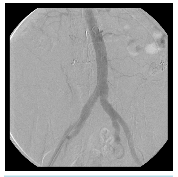
Figure 3. DSA evaluation of the aorta confirms the successful coil embolization of the lacerated artery.

Following embolization the patient's hematocrit remained stable. Venous duplex examination of the bilateral lower extremities revealed DVT in the right common femoral vein as well as the calf veins bilaterally. Patient was restarted on warfarin and discharged to a skilled nursing facility for further rehabilitation. The patient did will and once her INR was stable at a therapeutic level she was scheduled for IVC filter retrieval. The retrieval was uneventful. Interestingly, when the filter was sheathed and the legs captured, there was recoil motion of the embolic coils confirming the location of the filter leg against the lumbar artery.