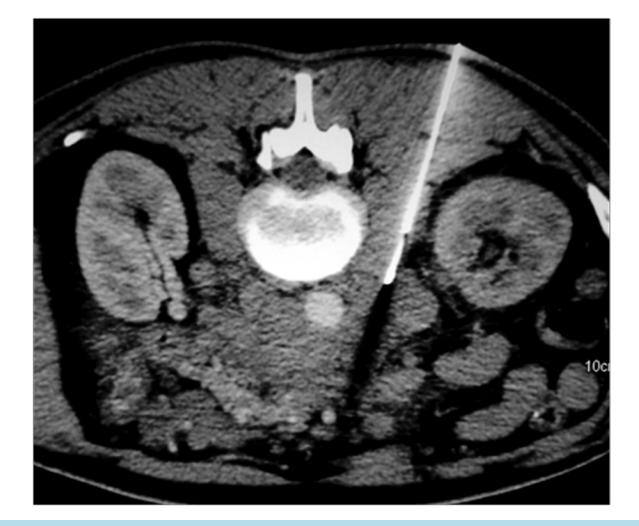
Figure 1. 52-year-old man presented with abdominal lymphadenopathy. Axial contrast-enhanced CT image at the time of biopsy needle introduction shows the needle passing safely to the left side of the aorta. Pathologically proved non-Hodgkin lymphoma.

The optimal management of patients with retroperitoneal masses depends on obtaining specific pathologic diagnosis. Percutaneous imaging-guided needle biopsy is now an established technique that has replaced open surgical biopsy in most of the cases because it is less invasive, less expensive and reduces hospital stay. The use