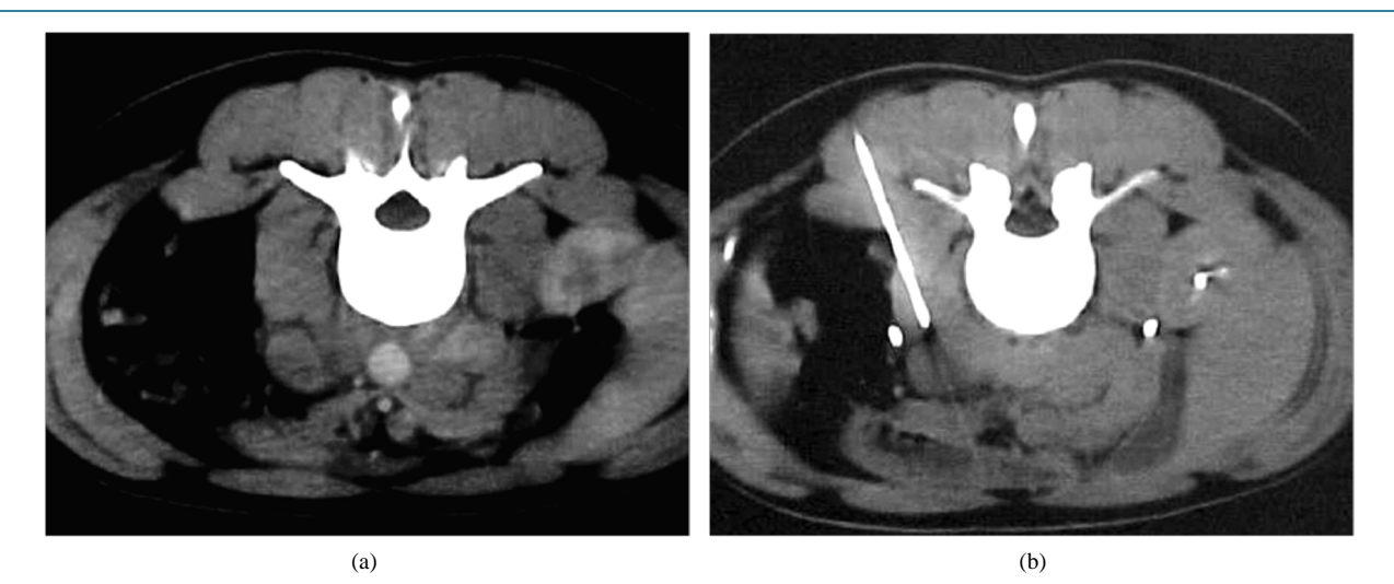
Figure 3. 45-year-old man presented with abdominal lymphadenopathy. (a) Contrast-enhanced CT image before biopsy needle introduction shows the lymphadenopathy and the aorta and IVC. (b) Delayed CT image at the time of biopsy needle introduction shows the ureters and the needle passing safely between left ureter and aorta. Pathologically proved metastatic adenocarcinoma.