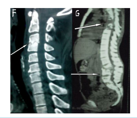
Figure 3. CT scan showing at the levels C3 - C4 (F), from T5 to T9 and from L3 to S1, with epidural and soft tissues abscesses (G) (patient 3).