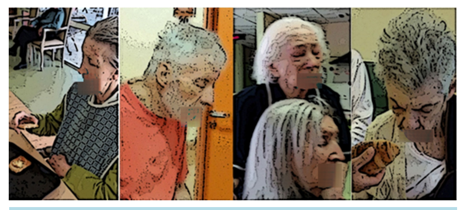
Figure 3. One of the consequences of failure of the phatic function: Regression.

an act of mutual identity giving [22]. For it to materialise, the availability of each person involved is indispensable. Alzheimer-patient identity break-down is linked to cognitive troubles and to the failure of the patient's attempts to enter into a relationship.