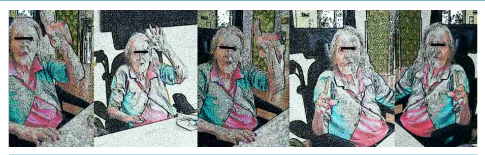
Figure 2. The phatic function in Alzheimer's disease.