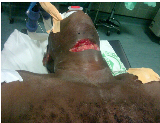
Figure 1. Cut throat.

The patient was resuscitated with intravenous crystalloids and started on intravenous antibiotics. He was given tetanus prophylaxis. No foreign bodies or subcutaneous emphysema was demonstrated on Lateral soft tissue neck x-ray. Chest x-ray done was normal. Haemoglobin at presentation was 12.4 g/dl with a Haematocrit of 40%. Patient was sent to theatre within 4 hours of presentation and had emergency neck and penile exploration under general anaesthesia. Neck findings were a single transverse upper neck incision measuring 8 cm \times 2 cm, severed strap muscles exposing the laryngeal prominence, the thyroid cartilage and oedematous vocal chords. The oesophagus was not injured. The carotid sheath and its contents were spared on both sides. Penile findings were an amputated glans penis, two ventral penile lacerations limited to the dermis and located 2 cm and 3 cm from the peno-scrotal junction. The urethra was not lacerated ventrally. Surgical procedures performed included laryngeal repair, strap muscle repair and a low tracheostomy by the ENT surgeon. The penile stump was refashioned after a urethral catheter was passed and the ventral lacerations were sutured by the Urologists ( Figure 3 ). A nasogastric tube was passed intra operatively.