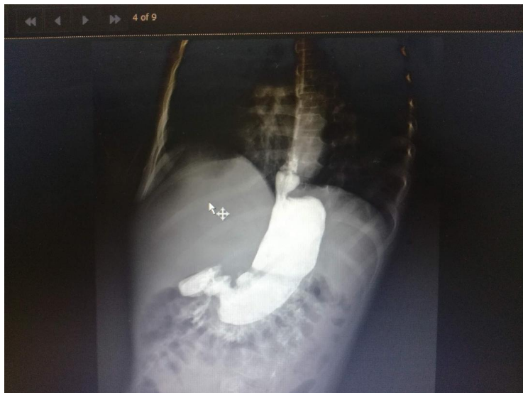
Figure 2. Wrap disruption in failed Nissen fundoplication.