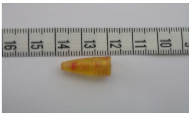
Figure 3. Foreign body aspirated by case 4.

Aspiration of a foreign body may result in immediate choking when lodged in larynx or may lead to complete obstruction of air entry into a lung segment [5,6]. Retained foreign body in the airway leads to local mechanical effects, chemical reactions and inflammation. An animal study has demonstrated that initial reaction to the presence of foreign body in the airway is polymorphonuclear leukocyte infiltration and edema which is followed by mononuclear leukocyte and macrophage infiltration. These findings have been interpreted as initiation of acute inflammation as early as three days after aspiration and progression to chronic inflammation as