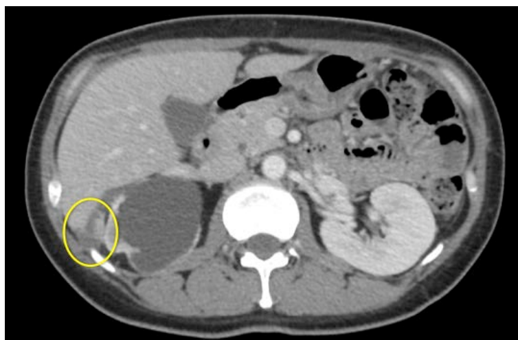
Figure 3. CT scan performed on post-operative day 17 revealed peritoneal dissemination in Morrison's pouch, which measured 23 \times 14 mm in size (framed region).