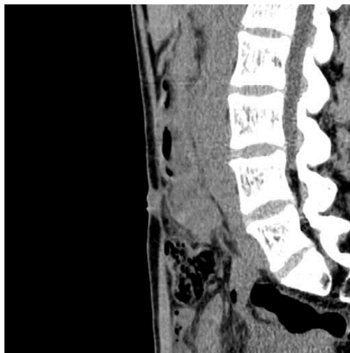
Figure 1. A reconstructed sagittal CT examination shows an umbilical mass.