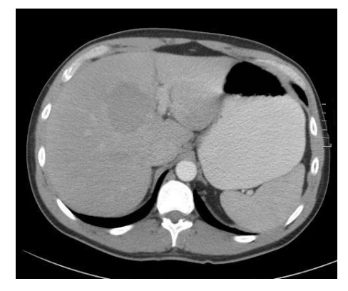
Figure 1. Contrast-enhanced CT of the abdomen in the arterial phase showing the unenhanced cystic mass in segment 4 (asterisk).

casionally consumed alcohol. His family history was significant for gallbladder cancer in his father. Computed tomography (CT) revealed a cystic mass, nonenhancing but with atypical features, in segment 4 ( Figure 1 ). The patient was taken to the operating room and the cyst was resected intact. The cyst appeared to be communicating with the right hepatic ductal system and had vascular branches from the right portal vein. The cyst was found to contain a thick brown purulent material culture of