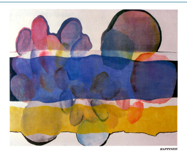
Figure 2. Rita Deanin Abbey: 1977, acrylic on canvas, 50 \times 70 inches.