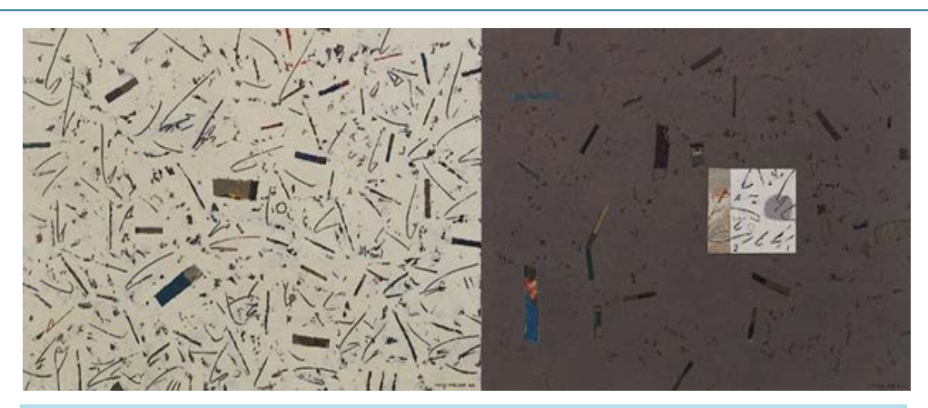
Figure 5. Primitiveness + child's mind, 2008 (mixed media on Canvas 60.6 × 145.4 cm).

origin. The author hopes that Hongtae Kim's works of art will give us the motivation to suggest a vision of contemplation and healing opportunity in contemporary Korean art<sup>7</sup>.