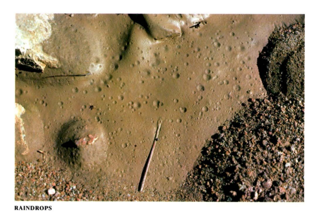
Figure 3. San Juan River, Utah.