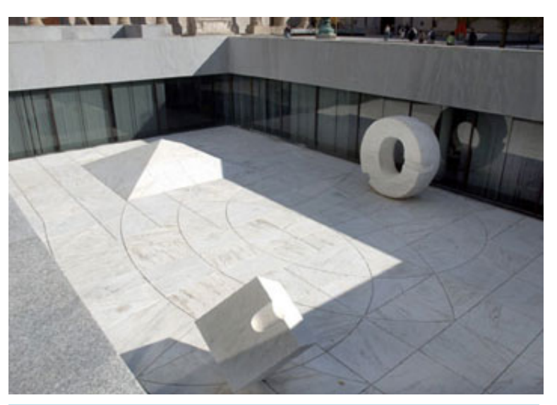
Figure 8. The Garden (pyramid, sun, and cube), 1963, location: Hewitt university quadrangle (Beinecke Plaza).

Library in one of several collaborative efforts with architect Gordon Bunshaft (1909-1990) who was among the first American architects to embrace European Modernism tradition. Garden extends to the library's paneled walls and its sunken courtyard is covered with creamy Vermont marble. And it evokes a contemplative mood. The cold materials of the space inspire not emotion but contemplation, reinforcing a studious atmosphere in the adjacent underground reading room. The mood seems to be similar to that of a Japanese Zen garden<sup>8</sup>, quietly balancing cosmic forces symbolized by the circle filled with sunlight and its energy, the pyramid characterizing the ancient history of the earth. This synthesis of Eastern and Western mood also unites past and future. His ultimate objective is to create and enhance public spaces through sculpture beyond individual space. Although Noguchi's sculptures began as simple geometric shapes, he soon moved toward more organic forms. In the end he merged geometric and organic forms. For him, gardening is considered as sculpturing of space for contemplation. His sustainable gardening work makes it possible to achieve the harmonious existence between man and