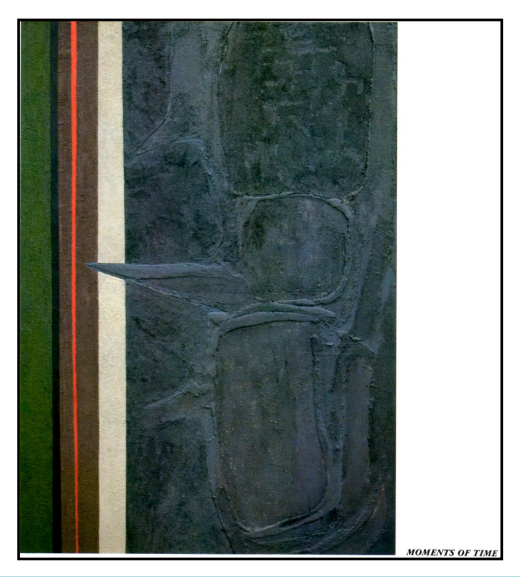
Figure 4. Rita Deanin Abbey: mixed media on canvas, 70 \times 50 inches.