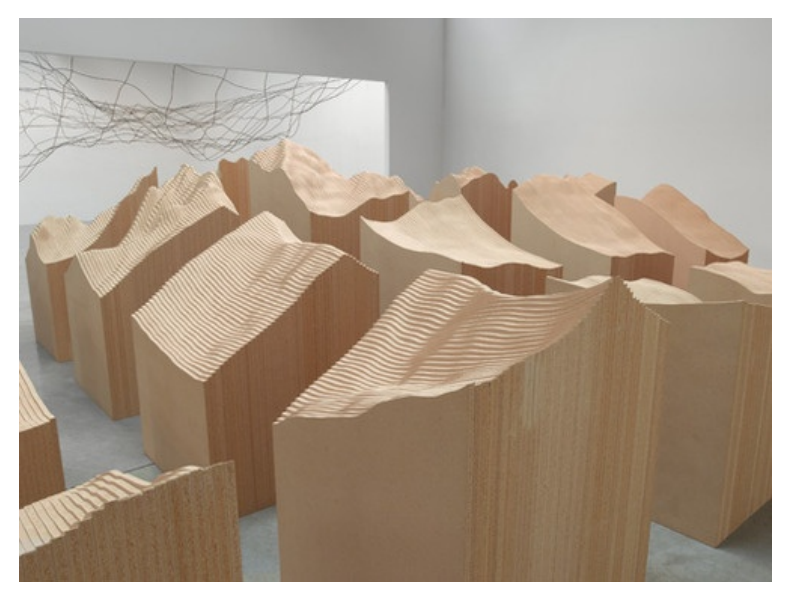
Figure 7. Blue Lake Pass (Pace Wildenstein Gallery, New York, 2009).