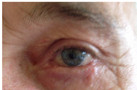
Figure 5. The state of the patient 2 weeks after the sutures' removal.