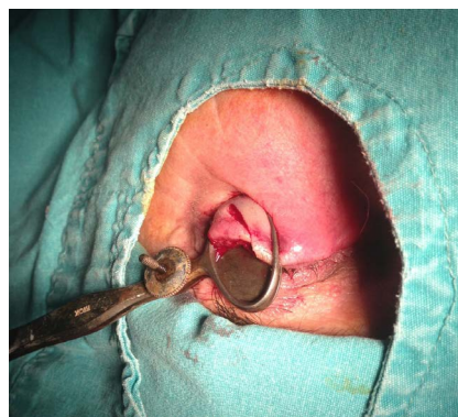
Figure 2. Local anesthesia application, the eyelid fixation using the chalazion tweezers and the incision of all lid layers.