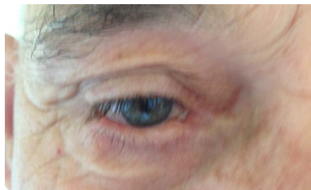
Figure 4. The state of the patient 2 weeks after the sutures' removal.