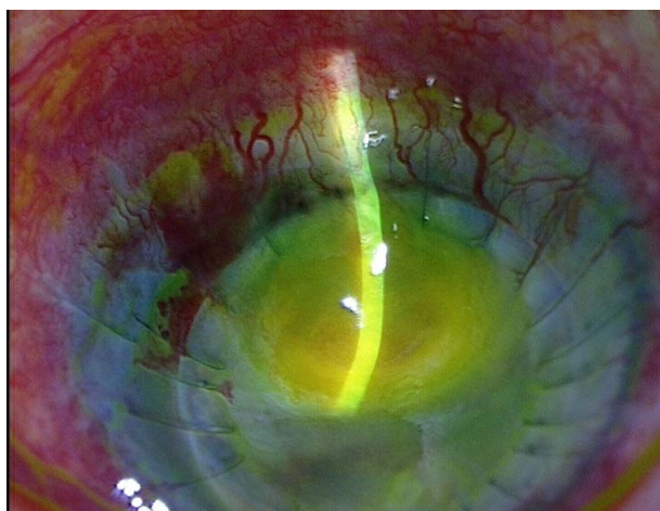
Figure 3. Left eye superficial vascularisation, epithelial defect and a descemetocoele.

round and the consensus was that the patient is likely to have significant anterior segment scarring with a poor prognosis with any further surgical intervention.