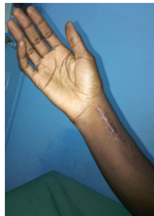
Figure 6. Wrist view at 17-year follow-up.