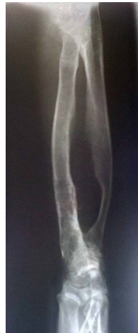
Figure 4. Radiographic control after removal of 17-year follow-up material (X-ray of 31 May 2016).