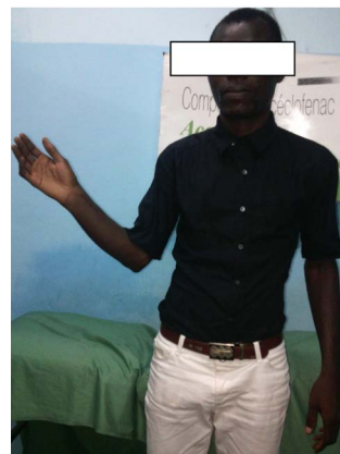
Figure 5. Wrist view at 17-year follow-up.