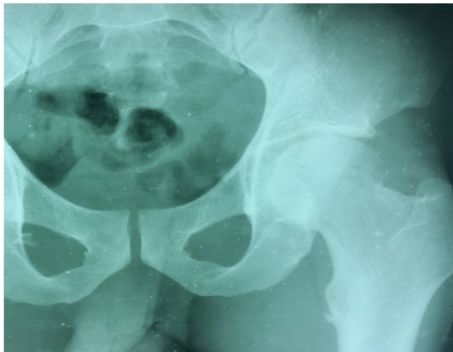
Figure 4. Anteroposterior radiograph of the pelvis with satisfying reduction of dislocations.