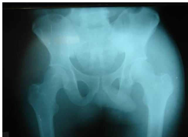
Figure 2. Anteroposterior radiograph of the pelvis with satisfying reduction of dislocations.