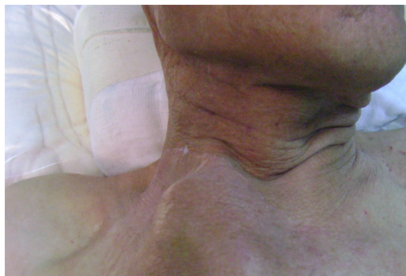
Figure 1. Swelling in front of the right sternoclavicular joint.

Laboratory findings on admission revealed hemoglobin 10.3 g/dl; total leukocyte count (TLC) of 9.000/mm 3 , with mild lymphocytosis and an erythrocyte sedimentation rate (ESR) of 50 mm in the 1 st hour (Witrabes method). Mantoux (tuberculin) test was positive with an indurations of 20 mm. Chest radiograph (PA view) revealed a normal lung parenchyma, without remarkable bone destruction in the sternoclavicular joint ( Figure 2 ). Computed tomography of the chest showed a heterogeneously enhanced mass lesion, which expanded over the right sternoclavicular joint and the surrounding tissues with a widening of the joint space and a subchondral sclerosis of the sternum ( Figure 3 ). MRI was not available. Due to the big size of the mass, we opted for an