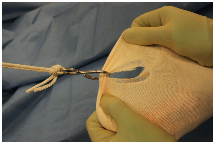
Figure 6. A hook is attached through the hole with weights for traction (close-up).