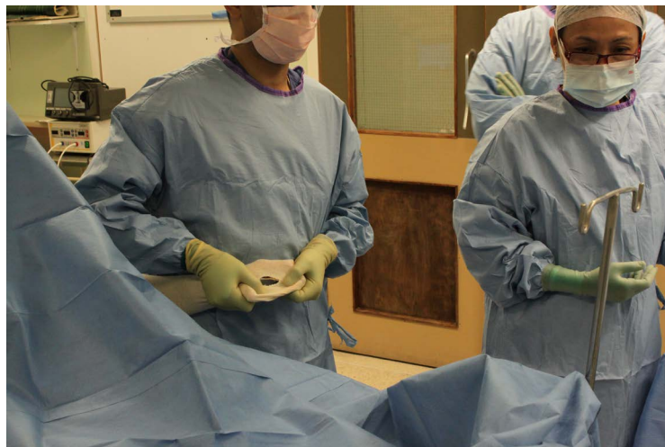
Figure 4. The hole is presented to unscrubbed theatre staff.