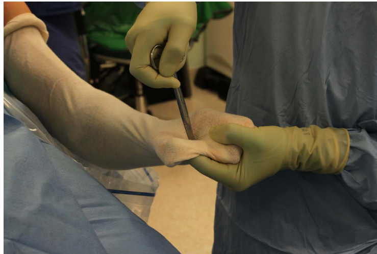
Figure 3. A hole is made bluntly through the space between thumb and index finger.