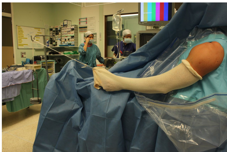
Figure 7. The set-up with drapes prior to final drape over unsterile area of hook through stockinette and its traction cord with weights.