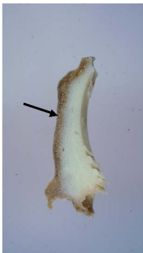
Figure 2. Retrieved bone cement sample used in the acetabulum (No. 1-a). The sample had yellow-brown discolored band (allow) which was observed in the area contacted with bone tissue.

Concerning biodegradation of the cement, Hughes et al. [16] reported that scission-based structural degradation occurred in the acrylic bone cement with FTIR analysis. Ries et al. [17] mentioned that fracture toughness of Simplex cement did not correlate with time in vivo between 1 month and 27 years of the samples retrieved from 43 patients undergoing revision total hip arthroplasty.