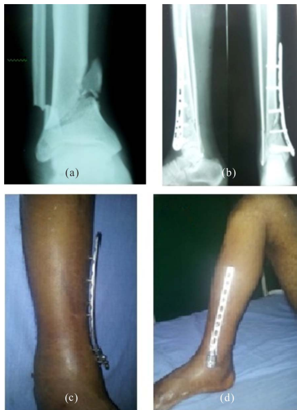
Figure 2. (a) Comminuted distal third fracture both bones leg pre-operative X-ray; (b) Post X-ray; (c) Clinical photograph with supracutaneous plate in-situ ; (d) Bone-plate construct stability with knee flexion.