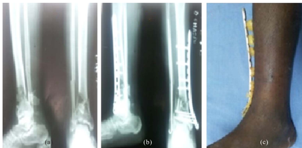
Figure 3. (a) Pre-operative X-ray; (b) Post-operative X-ray; (c) Clinical photograph.

However, LCP as an external device is superior and advantageous than other standard and circular external frames. LCP fixator can be concealed under clothing making it more acceptable to patients. There is much less tendency for the frame to strike the contra lateral lower leg in the swing-through phase of either leg during ambulation. Hardware removal can be performed under local anaesthesia. It imparts a less conspicuous radiographic silhouette compared with traditional fixators allowing ease of assessment of healing of fracture to treating surgeons. Small amounts of axial micro-motion may reduce stress shielding of fracture site. Load sharing during weight bearing may stimulate the developing callus until bony union. Controlled dynamisation by removing screws closest to the fracture site is possible, allowing some measure of control to the load sharing