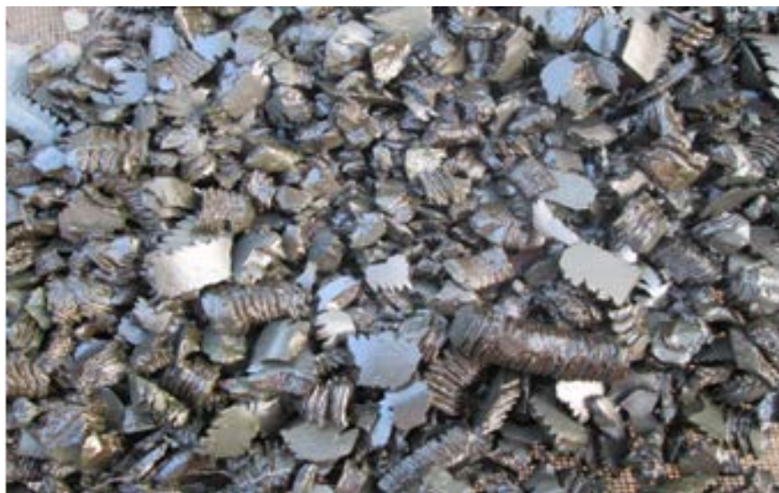
Figure 1. The upper strata returns drilling cutting of E_{2-3a} .

drilling fluid density was increased to 2.42 \text{ g/cm}^3 at around 2200 m, which was prepared for passing the first fault point. The first fault was drilled through successfully with normal cuttings return ( Figure 1 ) and no appearance of washouts.