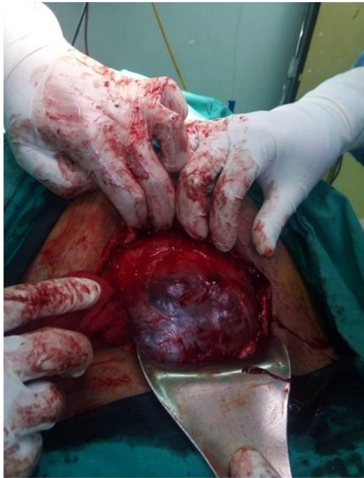
Figure 1. Plan the incision. In placenta previa centralis, the incision is at a high position. In placenta anterior with covering of the scar, the incision would be low.