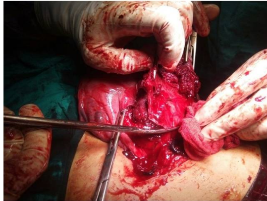
Figure 3. Excise the myometrium with the attached placenta. Reapplying the clamps, like Green Armytage and Kocher's clamps, to control bleeding from the fresh lower segment is helpful in this stage.

thromboprophylaxis. Women maintained postnatal follow up until completing 3 months after delivery.