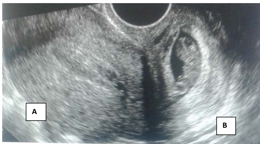
Figure 1. Ultrasound aspect. A: Empty uterus with a thickened endometrium; B: Left extra uterine mass.

It was an 18-year-old patient with no gainful activity, G2P0. She had already made a spontaneous miscarriage and had no other known pathological antecedents. She was received in obstetric emergencies for acute pelvic pain and bleeding in a two-month amenorrhea context. At the admission the general condition was relatively kept. The physical examination found sensitivity of the hypogastric region and the bleeding. Pelvic ultrasound found an empty uterus, a medium-abundance pelvic effusion, with a 3-cm left extra uterine mass (Figure 1). The initial rate of beta HCG was 5700 ml IU per ml. An ectopic pregnancy was suspected. The patient had received an emergency laparotomy. Post-operative exploration after aspiration of a medium abundance hem peritoneum highlighted a cracked right ectopic pregnancy. The left proboscis was the seat of an unbroken pregnancy of 3 cm of large axis (Figure 2). The diagnosis of a bilateral ectopic pregnancy was retained. A right salpingectomy and a left tubal caesarean section were performed. The anatomy pathology examination of the surgical parts showed an embryo on the left hand piece and numerous vesicles of varying size reaching 3 to 5 mm in diameter on the right salpingectomy piece.