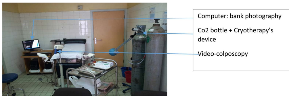
Figure 2. Screening room with equipment.