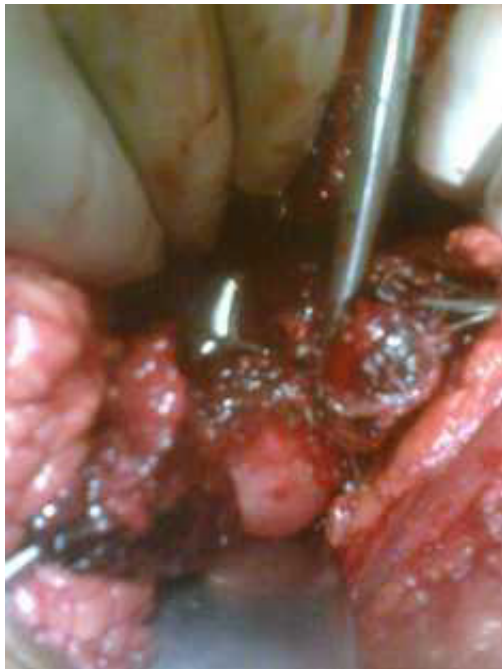
Figure 1. On the right side, there was a ruptured tubal ectopic pregnancy, and the left tube showed an organized hematoma of 2 × 3 cm size, protruding from the tubal ostium.