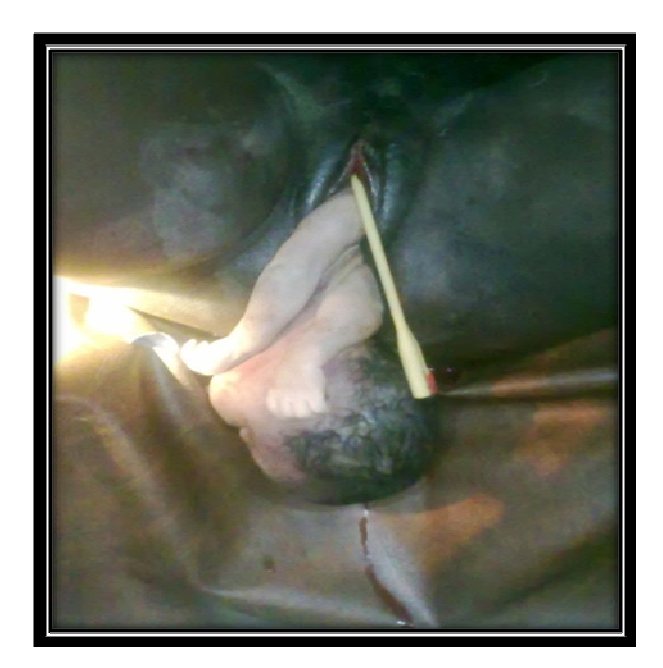
Figure 1. Foetal head and hands at the perineum.

The plan then was to prepare for Destructive Operation or Caesarean Section if there is no Skilled Hand to perform the Destructive Operation. Further review then requested for an Ultrasound scan to ascertain the nature of the suspected Fetal Abdominal Mass; Ultrasound revealed bilateral enlarged kidneys, with