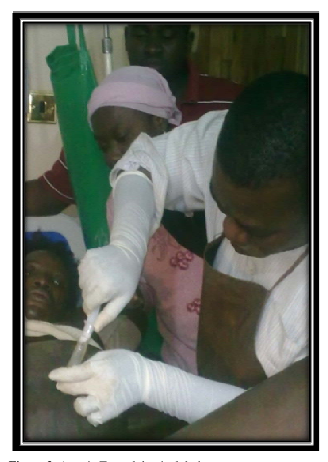
Figure 3. Aseptic Transabdominal drainage.

metronidazole were changed to oral preparations for the next five days and the gentamycin continued till fifth day postpartum.