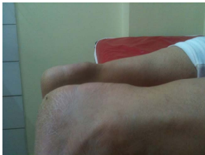
Figure 2. Bilateral gap existence at the achilles tendon.