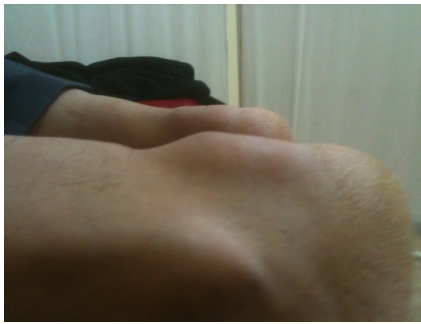
Figure 1. Bilateral gap existence at the achilles tendon.